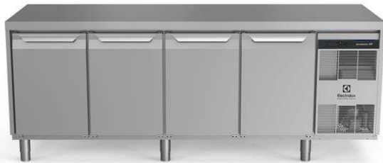
710065 (EH4HDAAAA) 4-door Refrigerated Counter 590lt, with right cooling Unit